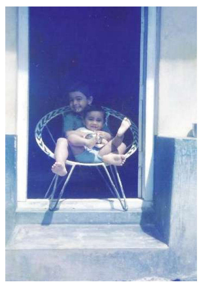
One of the earliest pictures together (Entrance to their maternal family home, Haripad, Kerala, 1998/1999)

If I had known, that cool January evening, outside the domestic terminal of Trivandrum International Airport, that it was the last time I was ever seeing you, alive or dead, trust me, dear brother, I would have never let you go.