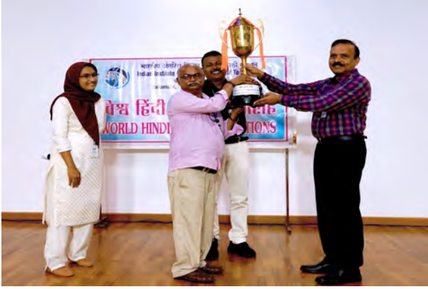
कर्मचारी प्रवर्ग से आम सेवाएं हाउस चल वैजयंती ग्रहण करते हुए

आईआईएसटी म.विश्व हिंदी दिवस समारोह – 2023 के उपलक्ष्य में जनवरी 11, 12 और 13, 2023 को संस्थान के छात्रों के लिए हिंदी एकल गीत, हिंदी कविता रचना, वैज्ञानिक/तकनीकी सामग्री का अनुवाद और कर्मचारियों के लिए जनवरी 10 और 16, 2023 को श्रुतलेखन, सरल अनुवाद और स्मृति परीक्षा जैसी विभिन्न हिंदी प्रतियोगिताएं आयोजित की गईं। जनवरी 26, 2023 को गणतंत्र