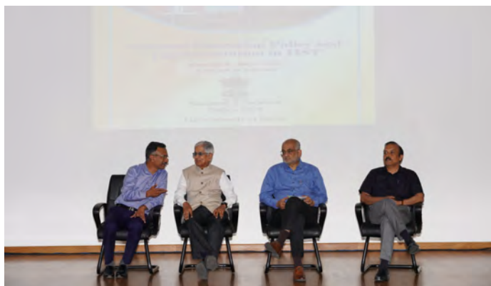
Honorable Chancellor and Director with resource persons