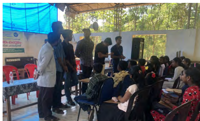
NIRMAAN volunteers interacting with participants