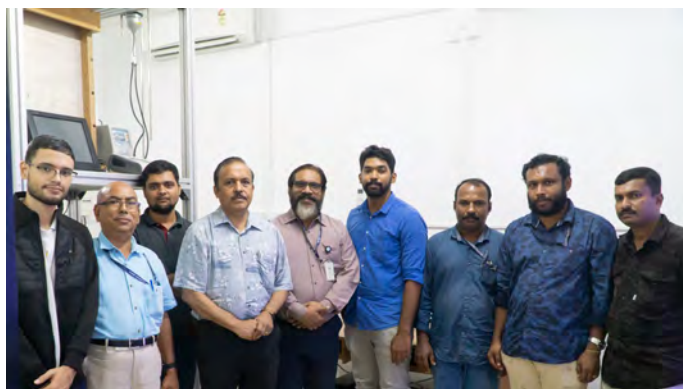
Director, IIST visiting Observatory at Ponmudi

Monthly balloon launches for the measurement of the vertical profile of ozone along with meteorological parameters have also been initiated under the coordination and support of the National Remote Sensing Centre (NRSC), Hyderabad. The observatory has a provision for the Tethered balloon launch with a payload carrying capacity of 3 kg up to 1 km.