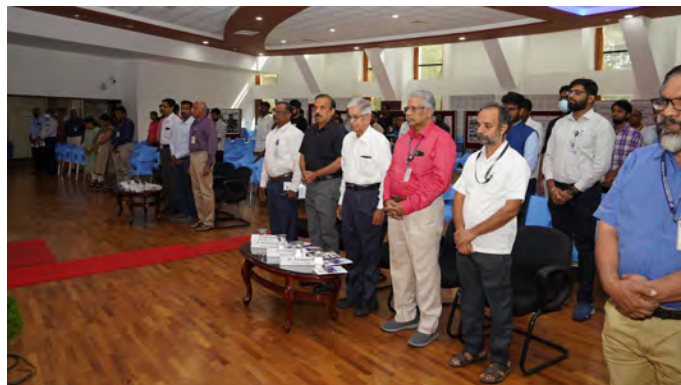
Participants of ASSET