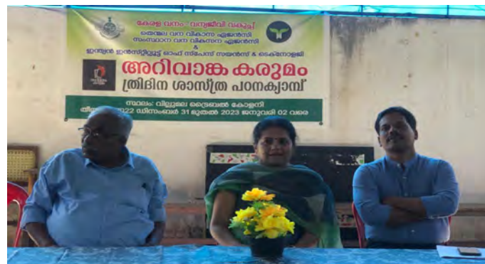
Inauguration of the camp

With a will to “demystify” science to the less privileged tribal students, the social outreach club of IIST- Nirmaan organized a camp for the students of the tribal settlement of Thenmala forest division. This camp organized from 31 st December 2022 to 2 nd January 2023 in collaboration with the Kerala Forest department was an attempt to transform a routine curriculum subject into a lifelong passion among the forest-dependent communities in the State. 40 school students of the