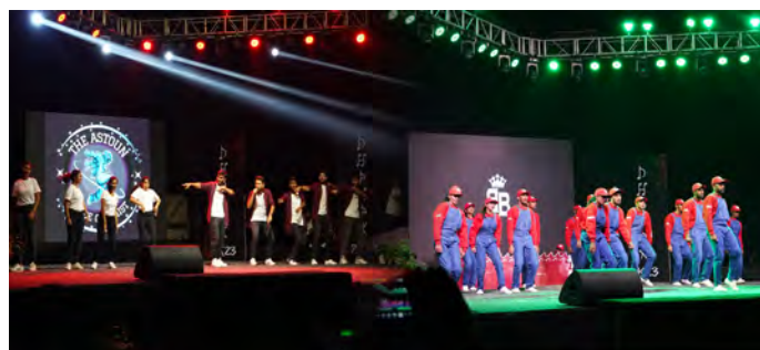
Dazzling dance performance by students

The solo singing and dancing competitions, treasure hunt, and fashion show were equally