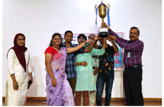
छात्र प्रवर्ग से आम सेवाएं हाउस चल वैजयंती ग्रहण करते हुए

दिवस समारोह के दौरान आयोजित पुरस्कार वितरण समारोह में हिंदी प्रतियोगिताओं के विजेताओं को नकद पुरस्कार और प्रमाण पत्र प्रदान किए गए। सबसे अधिक प्वाइंट प्राप्त हाउस को वर्ष 2022-23 के लिए रोलिंग ट्रॉफियां भी प्रदान की गईं। छात्रों के वर्ग से एवियोनिकी हाउस और कर्मचारी वर्ग से जनरल सर्विस हाउस ने रोलिंग ट्रॉफियां हासिल कीं।