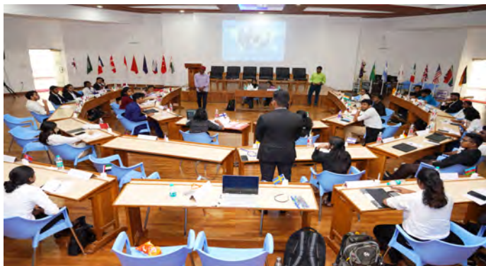
Diplomacy in action @ MUN