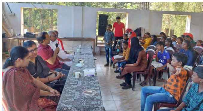
Director, IIST interacting with participants