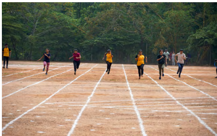
Race to victory