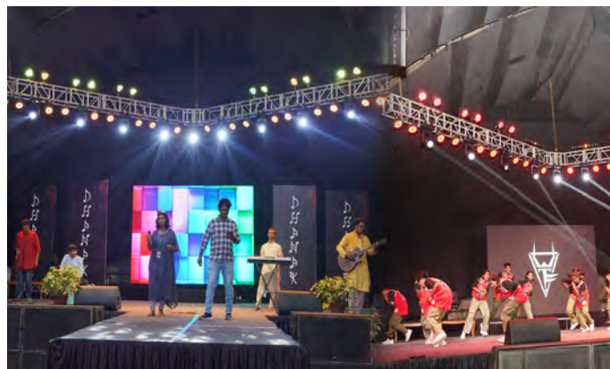
Rhythms in the air

The Street Play was a standout event that addressed the serious issue of drug abuse in an entertaining yet impactful way. The play was a culmination of hard work and dedication by the