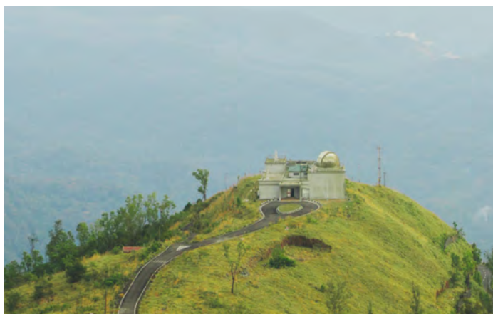
Observatory at Ponmudi

IIST has established a Climate Observatory at its Ponmudi Campus on the hilltop of the Western Ghats (PCO, 8.76°N, 77.12°E, 1 km, AMSL). It is equipped with state-of-the-art field instrumentation for measuring aerosol and cloud microphysics and meteorological variables. These instruments are also extensively used for lab and teaching courses at IIST.