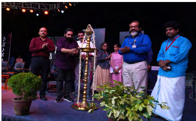
Dhanak Inauguration 2023

The Debate and Quiz competitions were equally exciting, with participants engaging in intense intellectual battles. The participants displayed their depth of knowledge and critical thinking, making the events thoroughly enjoyable.