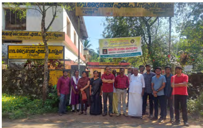
NIRMAAN volunteers with Director, IIST